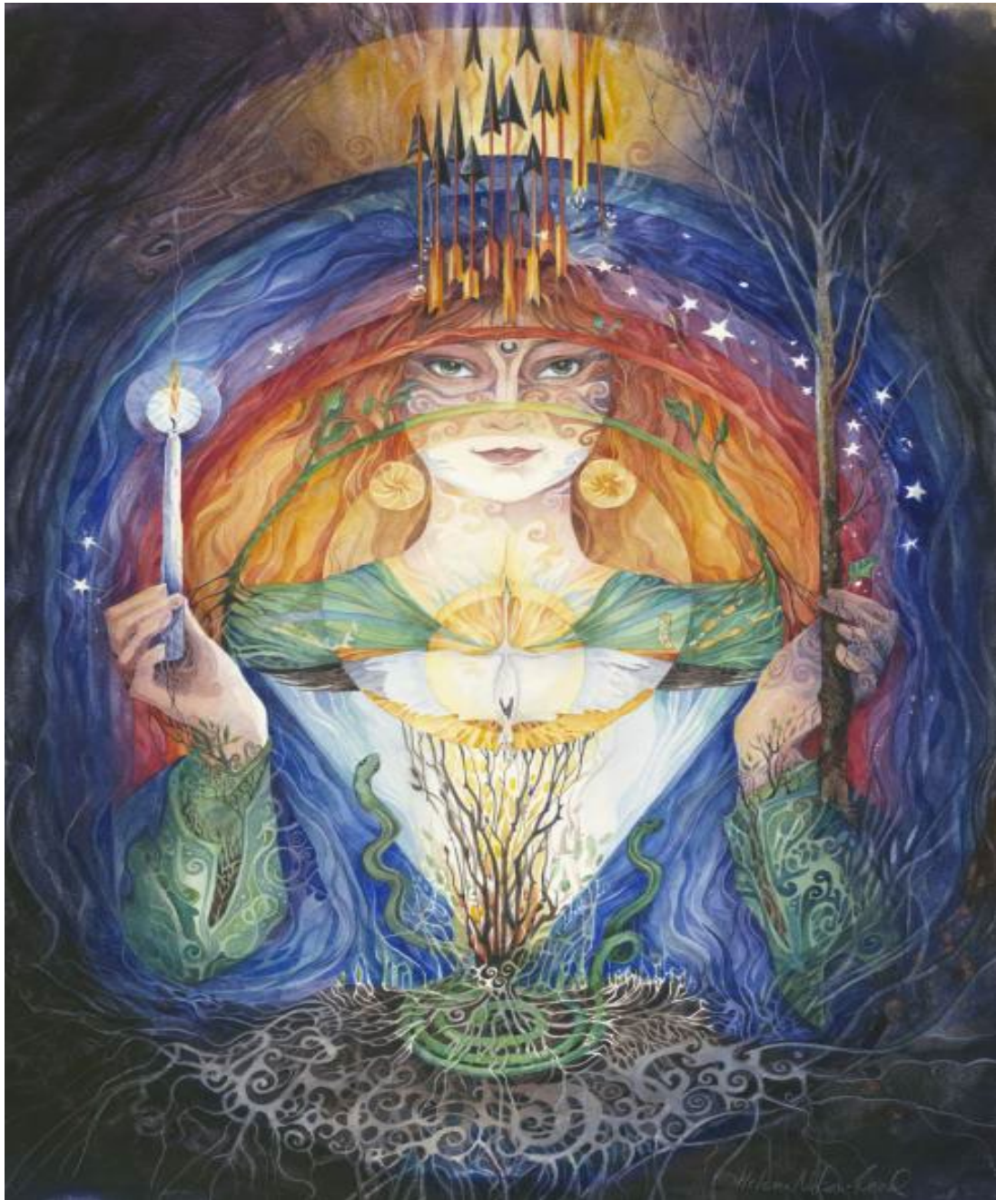
Brigid, the Flaming Arrow © Helena Nelson-Reed